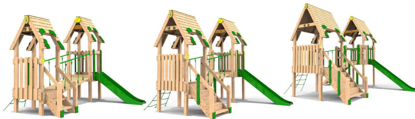
Large Deck Width