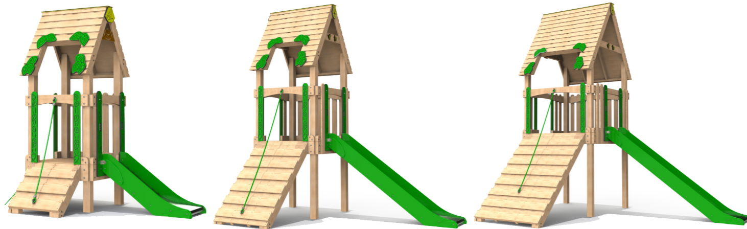
Large Deck Width