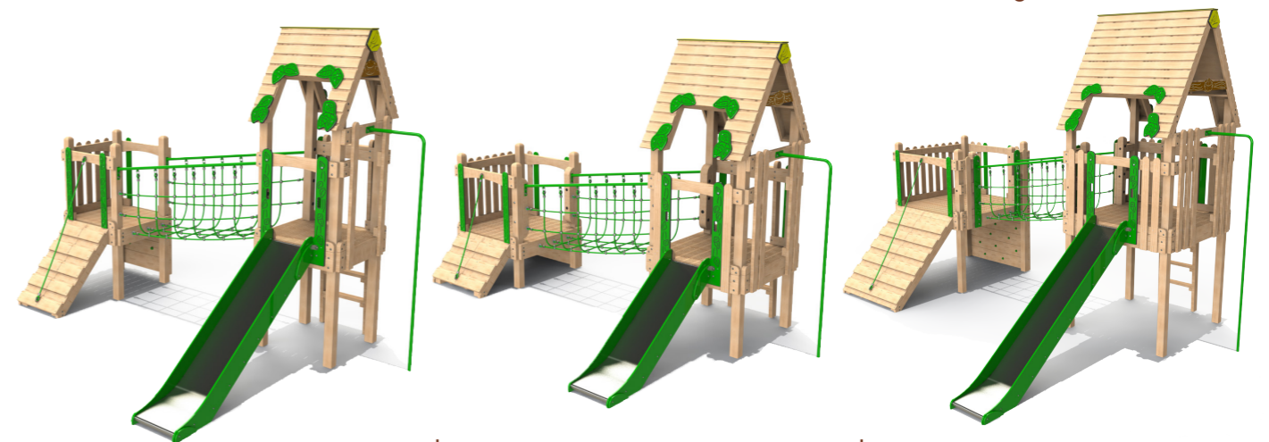
Large Deck Width