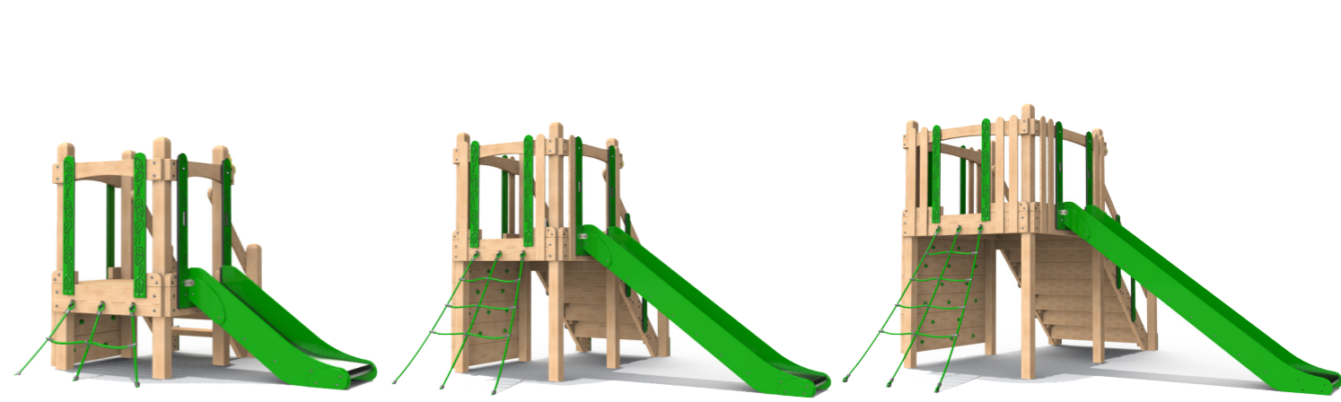
Large Deck Width