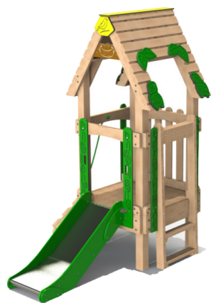
Large Deck Width